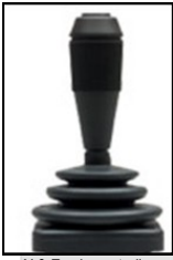
X & Z axis controller