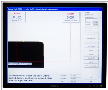
22" LCD display & user friendly interface